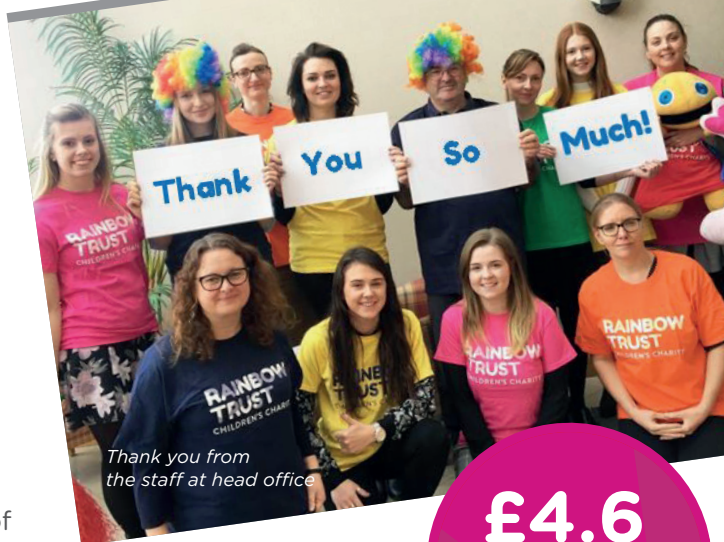
Thank you from the staff at head office

We are grateful to all the trusts and foundations that generously supported our work including The Kentown Wizard Foundation, The Linbury Trust, The Rank Foundation, Oak Foundation, Garfield Weston Foundation, The Ingram Trust, The 29th May 1961 Charitable Trust, The Rothschild Foundation, Sobell Foundation,